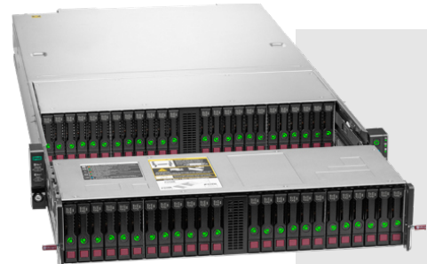
Enterprise Gen 10