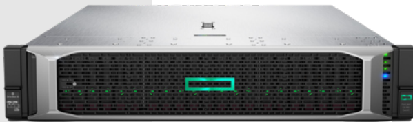
Essentials Gen 10